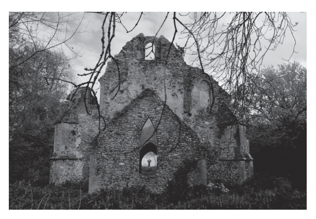
Figure 2. Image of All Saints Church, Oxwick, UK.

The themes of the images shown to students vary and are selected independent of the cultural enquiry taking place within that week's class. However, Week 5 presents an exception as the photograph displayed (Fig. 2) is designed specifically to prompt students into thinking critically about the way they consider folkloric narratives to be developed. In addition to identifying the subject of the photograph, students are encouraged to work in their groups to develop a ghostloric narrative that they can attribute to the image — in other words, they are asked to create and orate a ghost story that reflects the analysis they have made of the image in question. The exercise allows students an opportunity to consider the cultural differences in ghost stories and folklore, the geographic specificities of belief systems and offers an insight into the ways in which narratives might unfold and